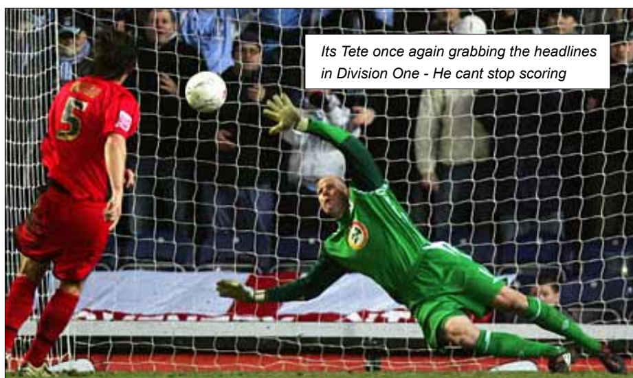
Its Tete once again grabbing the headlines in Division One - He cant stop scoring

Terrence Crooks corner caused confusion in the Ealing defence and Bonaventure Libih capitalised to give the home side a 1-0 lead after 21 minutes.